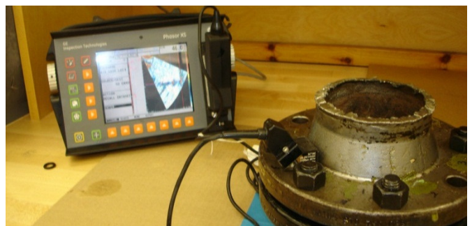
Figure 2: Inspection of a bolted and gasketed flange

which corrosion progression is estimated and used in risk based analysis inspection plans. This helps to minimize costs and provide a planning tool for future shutdowns.