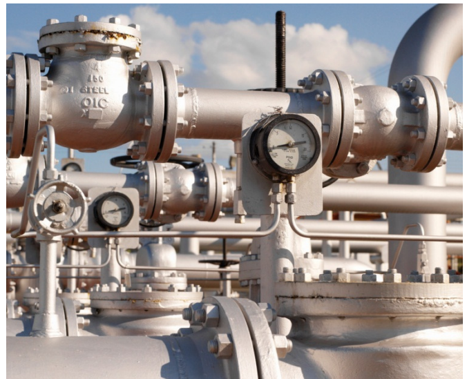
Figure 1: Typical piping system

The GE European Solutions Center presents a solution using the PHASOR XS ® . It can be used with either standard or custom built phased array probes. This solution provides a portable, light weight manual phased array system which can easily be instituted in to any inspection protocol. The examination can be performed by a single inspector from either the bolting surface or the taper face, depending on the customer requirement. The data consists of sectorial images from